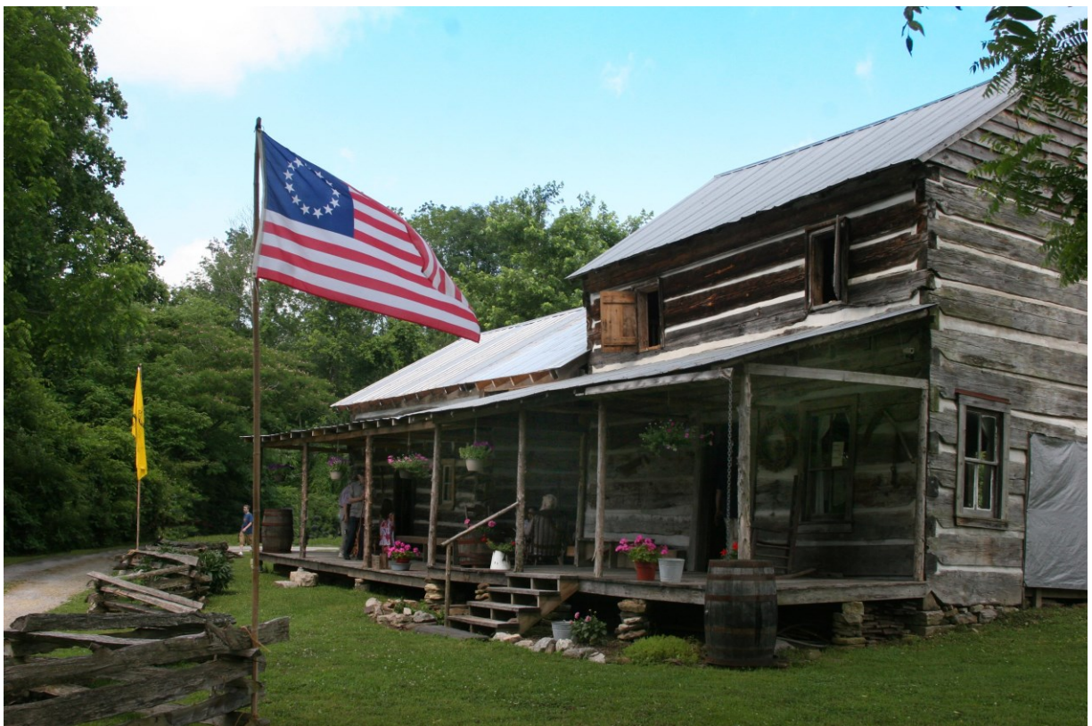
David Hall Cabin