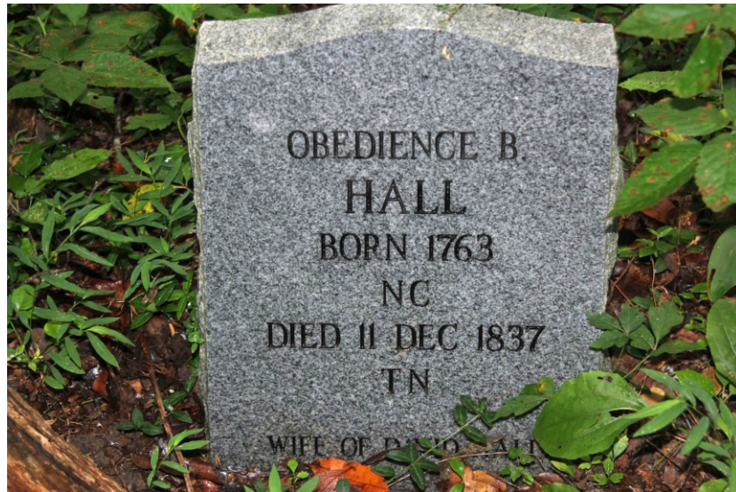
Obedience Brazle, wife of David Hall

(As published in The Oak Ridger's Historically Speaking column on September 6, 2017)