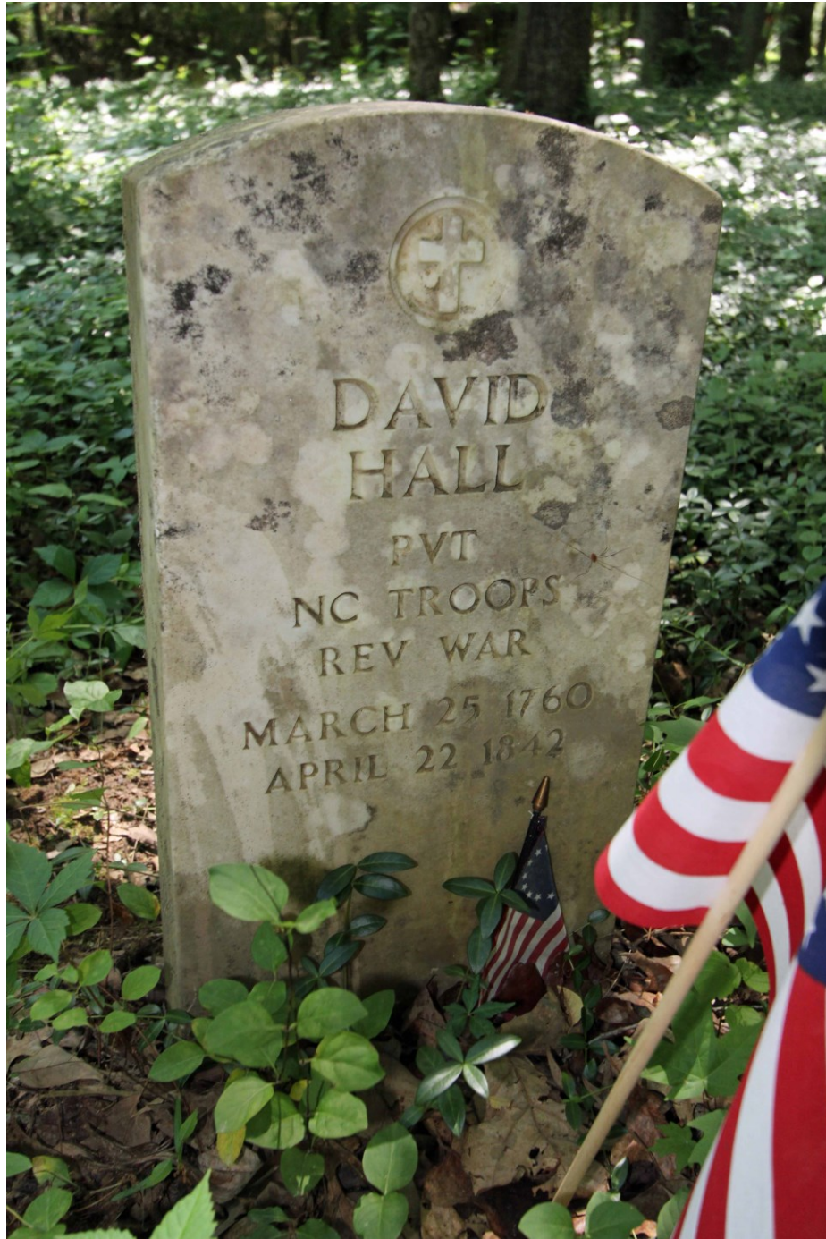
David Hall, Revolutionary War Veteran

(As published in The Oak Ridger's Historically Speaking column on September 6, 2017)